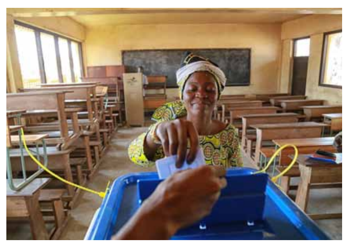
A woman casts her ballot in the Central African Republic during the referendum

Direct democracy is not a new concept. Mechanisms of direct democracy have been used with varying frequency around the world. In recent decades, direct democracy has become an increasingly important tool. However, despite the increasing salience of direct democracy, cross-national data on the topic has been lacking (WP 17:3). The V-Dem data set addresses this gap with data on direct democracy of unprecedented depth and scope. Based on this data, V-Dem Working Paper 17 (WP 17) presents a new index to measure the state of direct democracy around the globe. This policy brief presents the key findings of this new research.