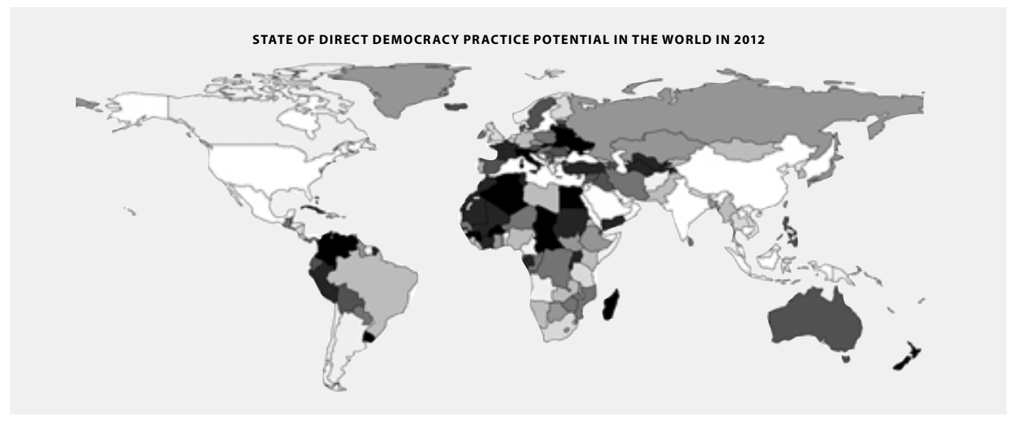
Figure 3. The darker the shade of grey, the higher the DDPP country score.

ent on the complex relationship of these components. For example, in some countries triggering a popular vote is easy, but nevertheless the potential for direct democracy is low due to participation quorums. This problem has been particularly acute in Eastern Europe (Altman 2016). In other countries, such as Switzerland or Australia, double majorities of cantons or states are required for certain types of mechanisms of direct democracy be approved. Similar situations occur with approval quorums or super-majorities, although these qualifications are much less used and extended than the former ones.