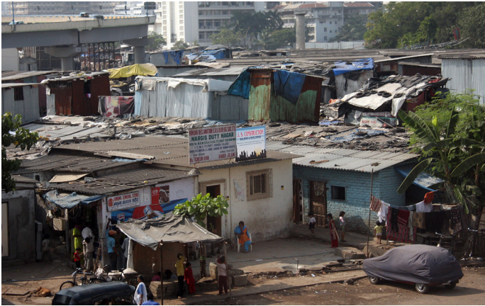
Urban Poverty.