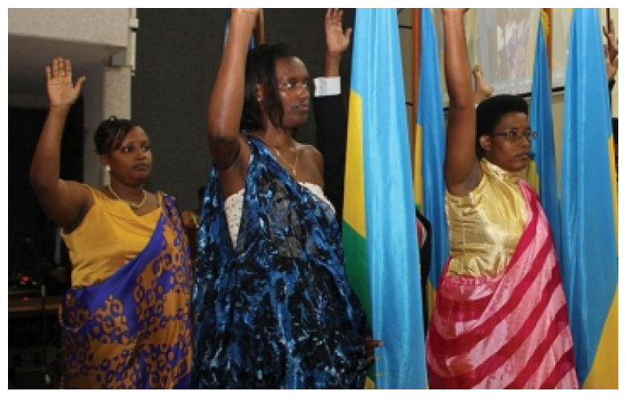
Swearing-in of Members of Parliament and other government officials in Kigali, Rwanda.

What are the implications of women's political representation? This question gains more relevance in an age when more and more women are taking political leadership positions. Sub-Saharan Africa is the region with one of the most dramatic advances in this matter. However, whether women in parliament actually achieve substantive policy changes for other women is unclear. In a recent working paper (WP 88) for the Varieties of Democracy Institute (V-Dem), Valeriya Mechkova and Ruth Carlitz address this issue by introducing the "gendered accountability" framework as a tool to analyse policies unequally affecting women. This policy brief presents the key findings of their working paper, as well as several policy implications.