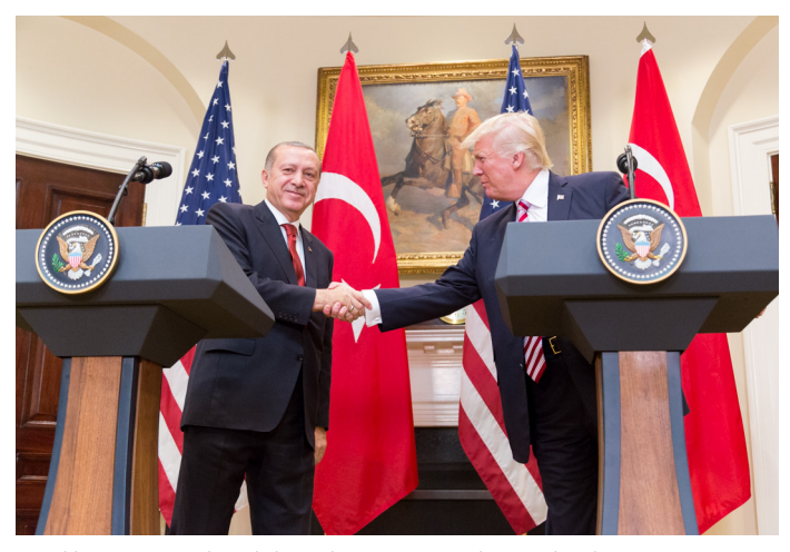
Donald Trump receives the Turkish President Recep Tyyip Erdoğan in the White House in May 2017.

Populism has evolved into a wide-spread and much-discussed global problem. Populist leaders challenge democratic rule with anti-pluralist rhetoric. The global rise of populism is closely related to the currently emerging third wave of autocratization, which affects a multitude of regions worldwide (Figure 1). Two recent working papers (WP 75 and 76) for the Varieties of Democracy Institute (V-Dem) address these two processes and develop new tools to investigate these emerging phenomena. This policy brief presents key findings, as well as further policy implications, building on these new insights.