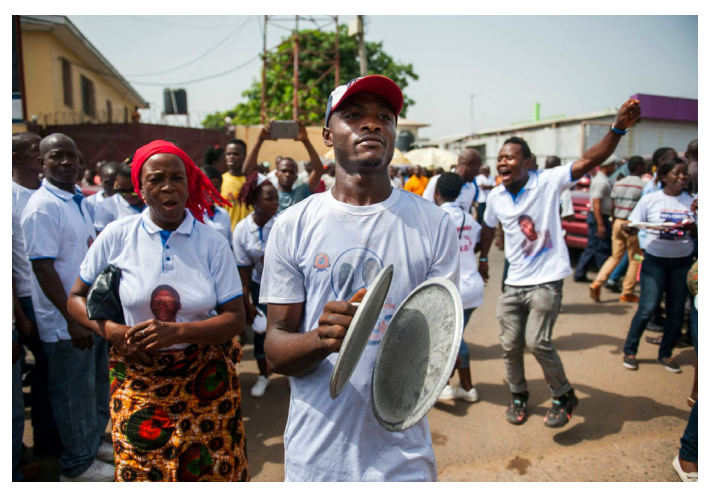
Official Election Certification Ceremony in Liberia