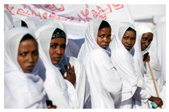
International Women's Day March in El Fasher, North Darfur.