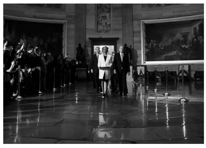
The Articles of Impeachment being walked from the House to the Senate in the United States Capitol. House Judiciary Democrats (@housejuddems), 1/16/20

How and in what order do accountability subtypes and their aspects develop? What roles do different types of constraint on the government play in the maintenance of democratic peace? Two recent, related articles answer these questions using V-Dem data. The first study (Mechkova et al. 2019) attempts to map the order in which accountability subtypes and their specific aspects develop. It finds that high levels of vertical accountability are observed before high levels of other forms of de-facto accountability. The second study (Hegre et al. 2019) investigates the presence and strength of the three subtypes and the continuation of democratic peace between states. Contrary to prior studies, the authors find that vertical accountability is less effective at preventing inter-state wars than either horizontal or diagonal accountability.