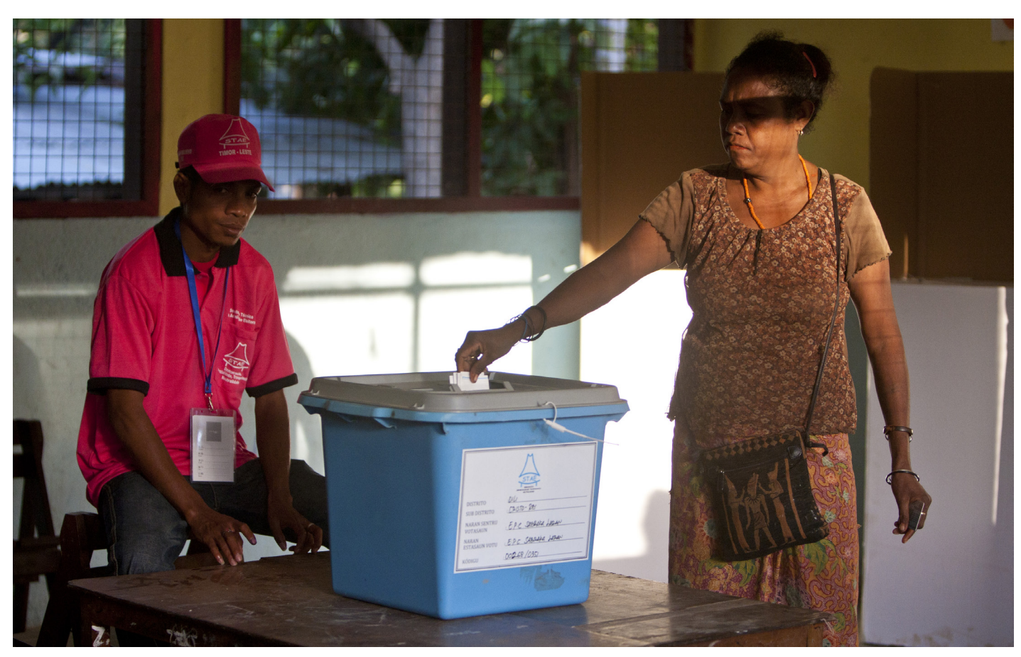
A voter casts her ballot in Timor-Leste's parliamentary elections.